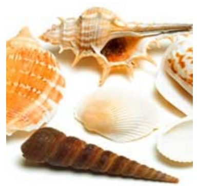
Assorted shells ($1/shell)