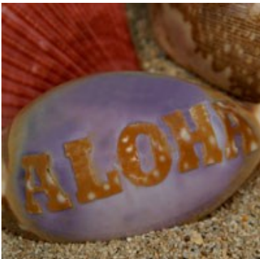
Shell Carving ($8/shell)