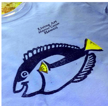
Dory shirt (included in Finding Kimo)