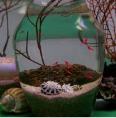
Custom made Opae Aquariums can be enriched with shells and black coral. They are stunning to see.