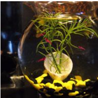
The glass globe looks great on any desk or shelf and is a little larger than other models. For this reason, a shell and plant is included as well as five Opae Ula..