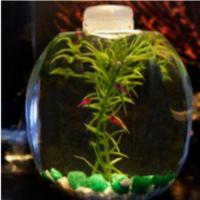
The mini home is the smallest of the Opae Ula Aquariums.