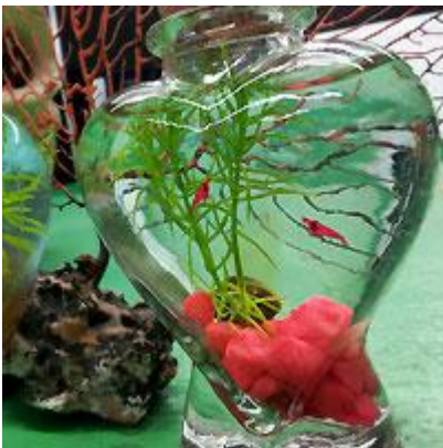
Share the love and pick this heart shaped Opae Ula aquarium.