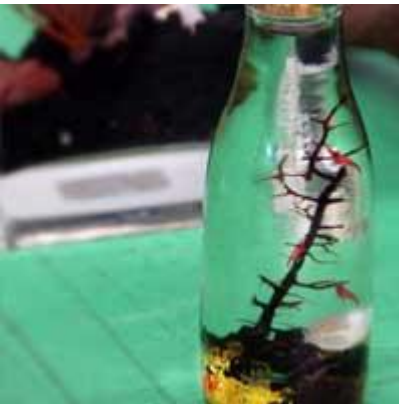
This cute mini aquarium was made during the Opae XL workshop.

more information: livingartmarinecenter.com - 841-8080